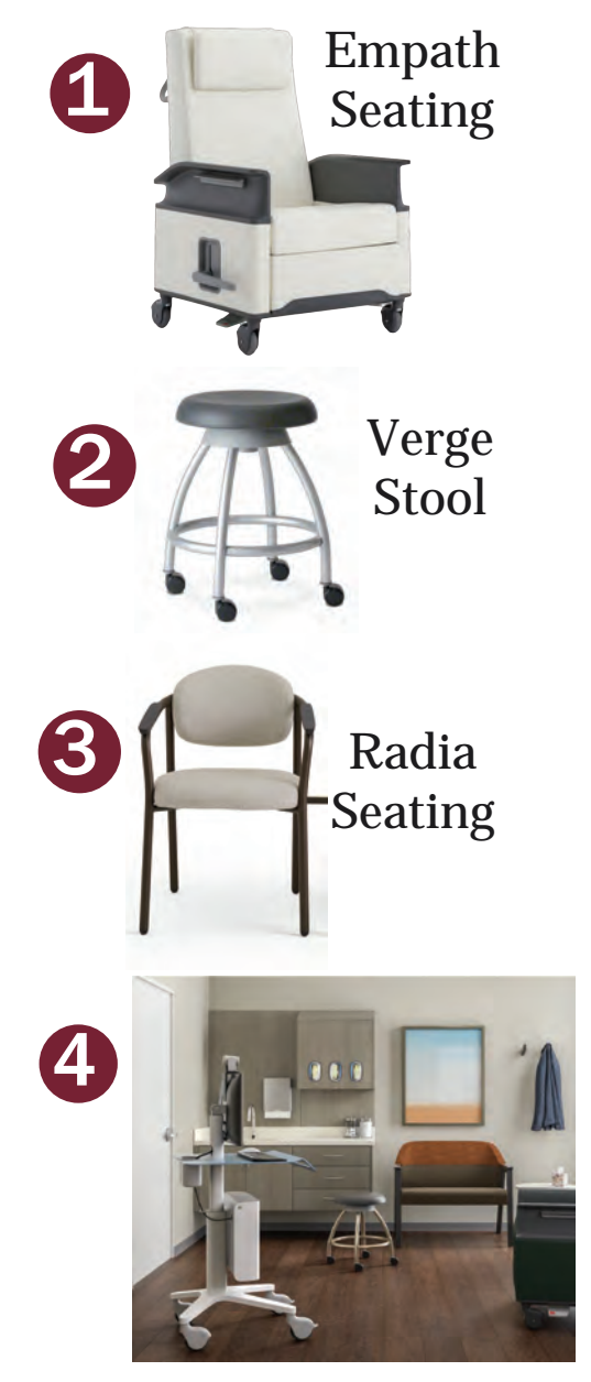
Convey Modular Casework